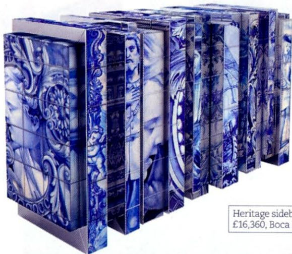
Heritage sideboard, £16,360, Boca Do Lobo.

With its revamped look and impressive industry breadth, 100% is back as the grande dame of the festival. The entire interiors world, from work-surface manufacturers to newly examined design students, passes through the massive exhibition at some point during the event. Look out for Vitra, Bark, Tisettanta and Knoll. Highlight The launch of Yo! Home at 100% Future Living, a new kind of newbuild from the man who made sushi a lunch staple.