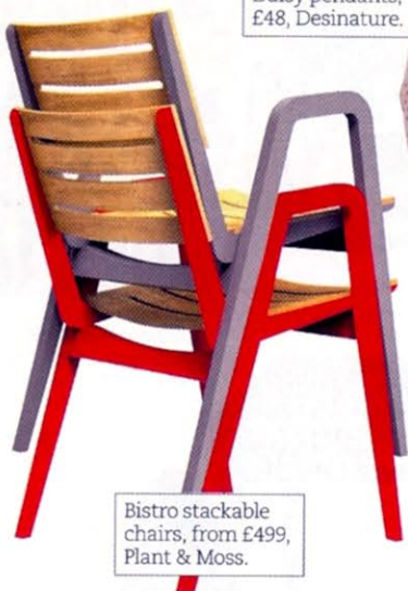
Bistro stackable chairs, from £499, Plant & Moss.