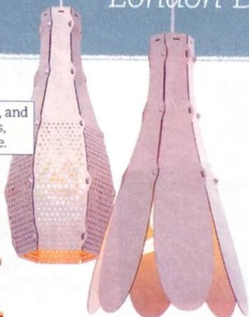
Long Bud, £115, and Daisy pendants, £48, Desinature.