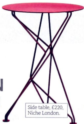
Side table, £220, Niche London.